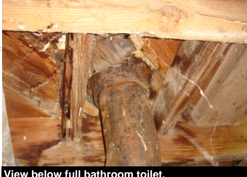
View below full bathroom toilet