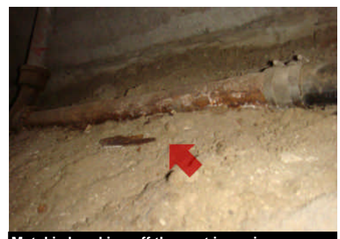
Metal is breaking off the cast iron pipe.

[RU] The cast iron pipes are apparently at the end of life. I recommend replacing the corroded and rusted pipes.