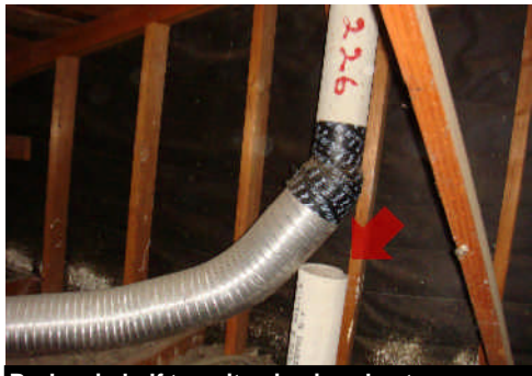
Broken in half transite pipe is asbestos.

[SC] The transite pipe is asbestos and was broken in half to install the vent flex duct.