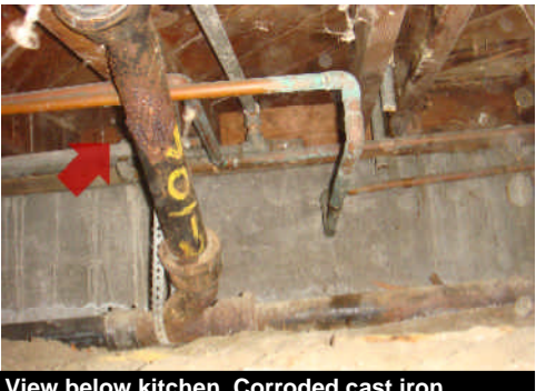
View below kitchen. Corroded cast iron.

[RU] The hot water supply pipes in the craw space are not insulated. I recommend insulating the hot water supply pipes to help minimize heat loss.